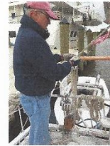
Lots of knots, lots of practice