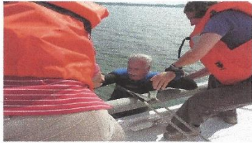
Man Overboard Training, CPR, passenger, and crew safety are all part of crew and docent training