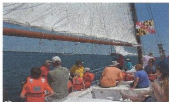
Docents share stories with passengers