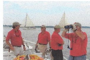
Sometimes sailing is just looking for the wind